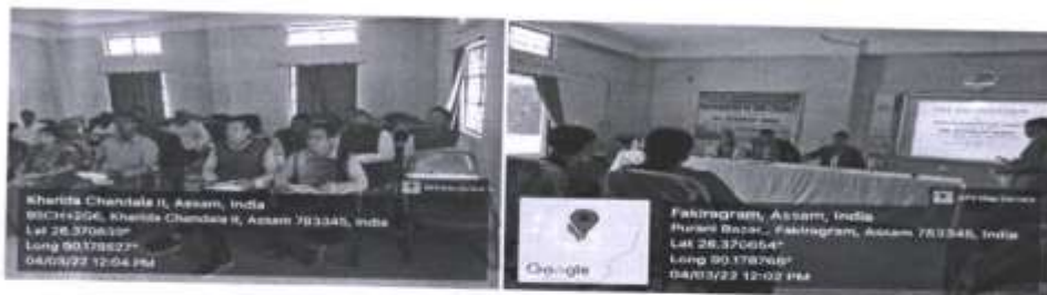
Signature of Organizer